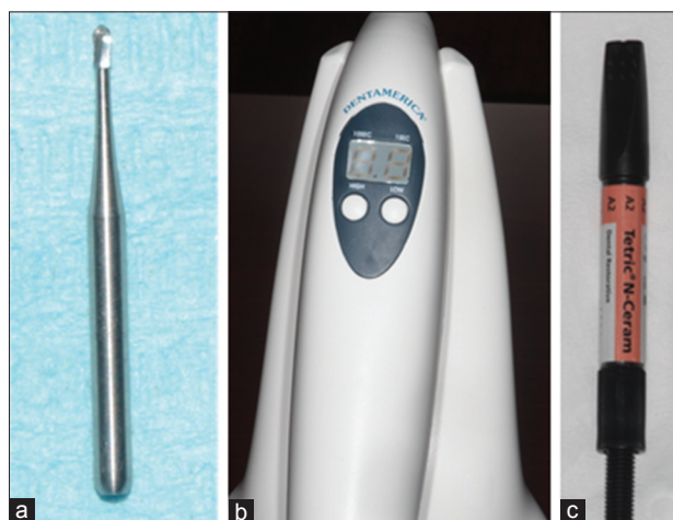
Figure 2: Cavity preparations and restoration materials; a: 330 bur. b: Light curing unit. c: Composite restoration

This in vitro study was designed to evaluate and compare the fracture resistance of standard and modified conservative MOD cavity designs to mimic the clinical situations where the occlusal caries lesion does not extend beyond the DEJ. The result presented that as the progressive reduction of the tooth structure at the different groups increased as the fracture resistance decreased. Furthermore, the results showed that MOD cavities with occlusal extension in the enamel layer had significantly higher fracture resistance than MOD cavities that extended beyond DEJ.